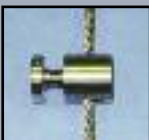
900-04-001 Stainless Steel Drilled Panel Connector