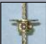
863-0400-02 Light Clamp Ring With Adapter