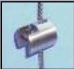
900-04V-005 Stainless Steel Vertical Panel Connector

Field adjustable vertical assembly with 15' cable, 857-0400-035 Swivel End, 831-0400 Field End, and two pieces 836-0600-05 Cover Disk. Installation hardware sold separately.