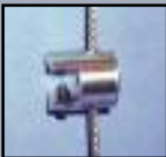
900-04H-005 Stainless Steel Horizontal Panel Connector