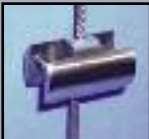
900-04DV-005 Stainless Steel Double Sided Panel Connector